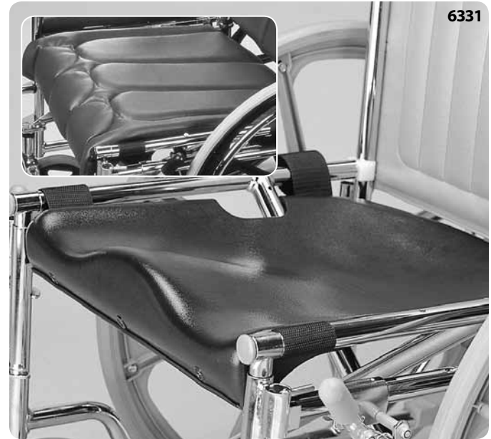
May be configured as a wedge to help prevent forward sliding.