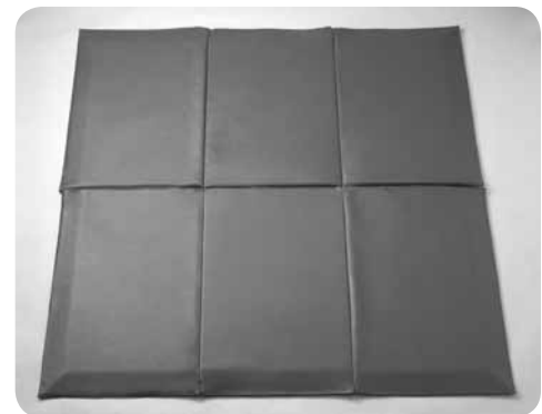
Connect two Floor Cushions to create a wider area of coverage

NOTE: Due to the random possibility of falls, the Posey Company makes no guarantee, express or implied, that the user is protected from hip trauma.